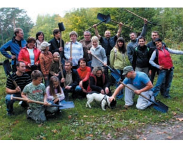
Each year, employees of LeasePlan plant an entire forest to compensate for carbon dioxide emissions of their business cars – Tree Day 2007