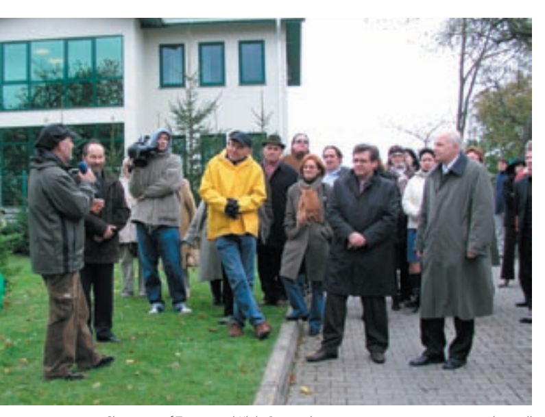
Chairman of Troton and Klub Gaja welcome guests to an inauguration that will take place in an orchard that was saved by the companies – Tree Day 2006