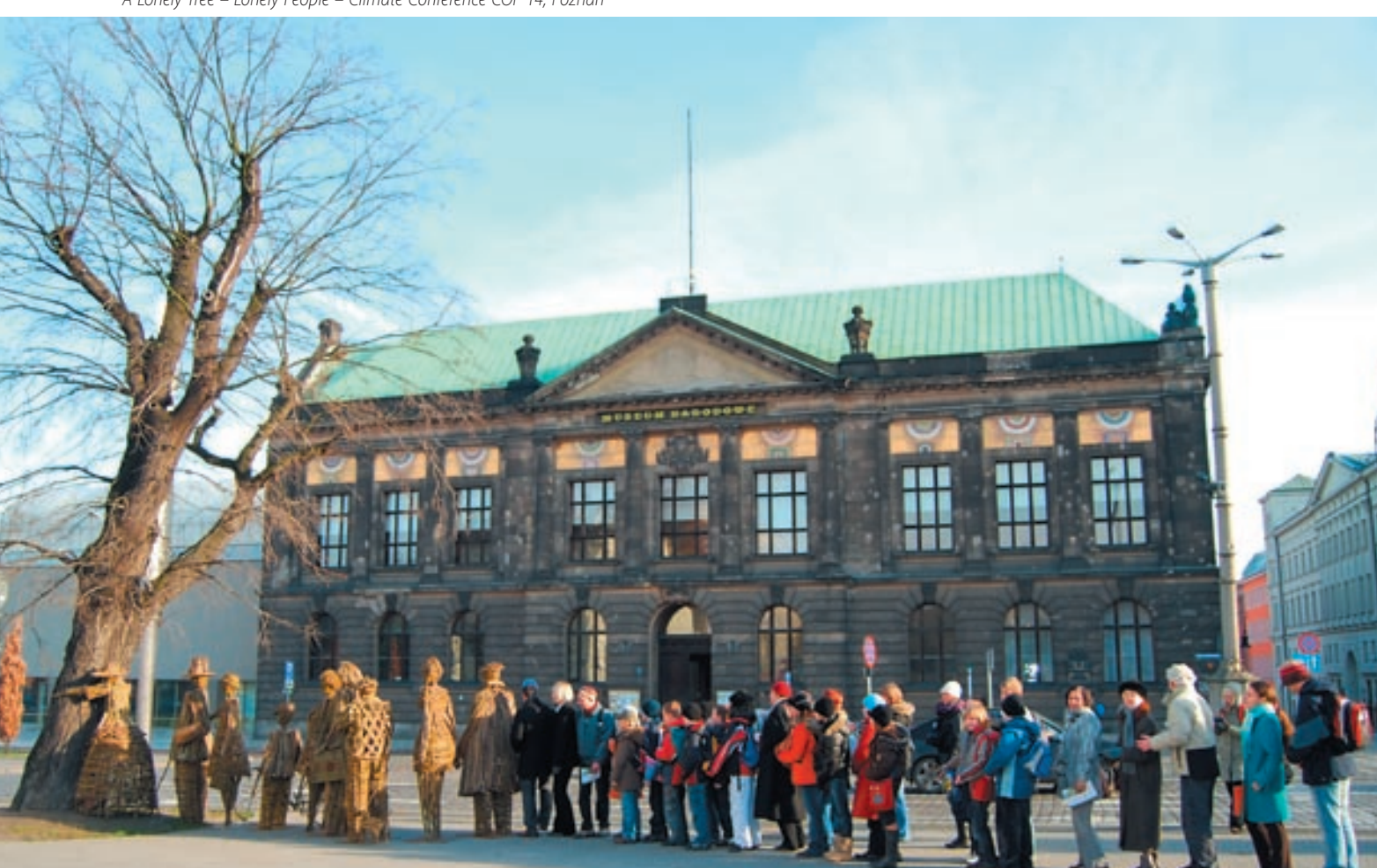
A Lonely Tree – Lonely People – Climate Conference COP 14, Poznań

As part of preparation for COP 14, Ministry of Environment has created a platform of cooperation called Partnership for Climate between the ministry as the main COP14 organizer and institutions and other actors concerned with education in the field of climate change prevention. Klub Gaja joined the Partnership for Climate , promoting Tree Day as a good practice for climate.