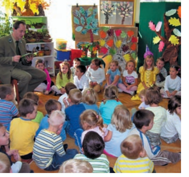
Each year, State Forests also lends assistance of their specialists – forest rangers, in the field of ecological education.

44 Heads of Diplomatic Missions to Poland planted a row of linden trees in Krynki Forest District. In this way, each country has its own little tree here, at the fringe of United Europe – Tree Day 2008.